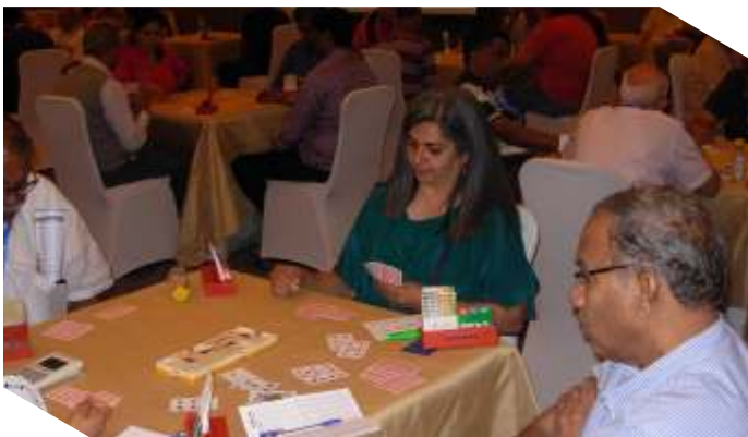
A Rose by any other name