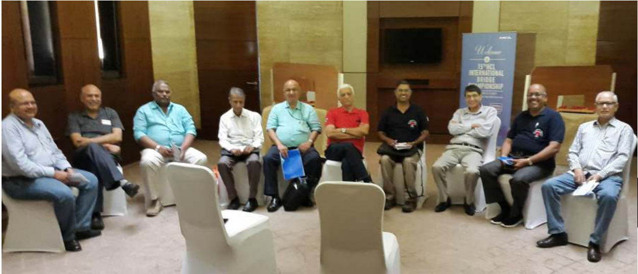
All The King's Men

Directors Special is a popular Indian spirit. Trying to catch the right spirit. Cheers Gentlemen!