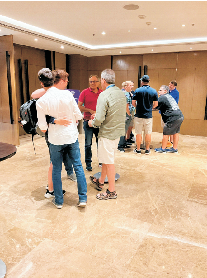
Team WHAM (AUS and NZ) and Team Shourie (US) in a couple of huddles just after the final match got over.