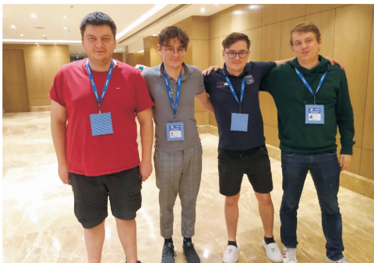
Azs Buboslovakia team

In the Other room, the bidding was identical up to the 3♥ bid. South now crossed 3N himself, bidding 4♣. North showed Spade control, first or second round, with a 4♠ bid. When that was doubled, North rebid 4N suggesting that he did not have two fast Spade losers. That was enough for South to bid 6♣.