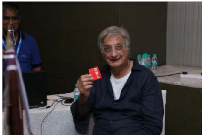
Zia doubles to show support !!

In the Closed Room, Kiran overcalled 2♣, Zia