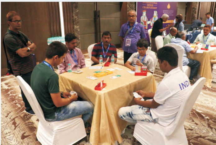
The Future - India Sub-Juniors & Kids